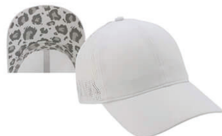
Lt Grey/Grey Leopard