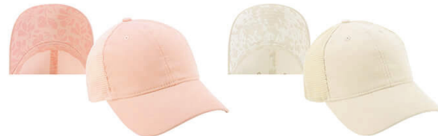
Pink Sorbet/Floral/Pink Sorbet