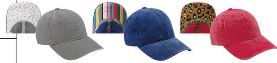
Lt. Grey/Polka Dots