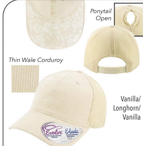
Thin Wale Corduroy