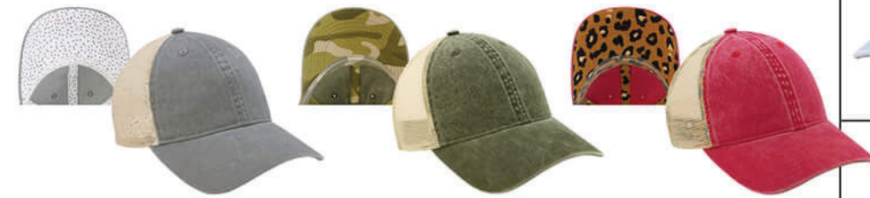
Lt. Grey/Polka Dots/Khaki