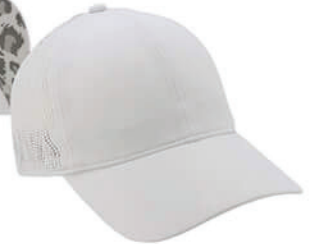
Lt Grey/Grey Leopard