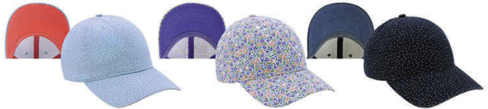
Lt Blue w/ White Polka Dots